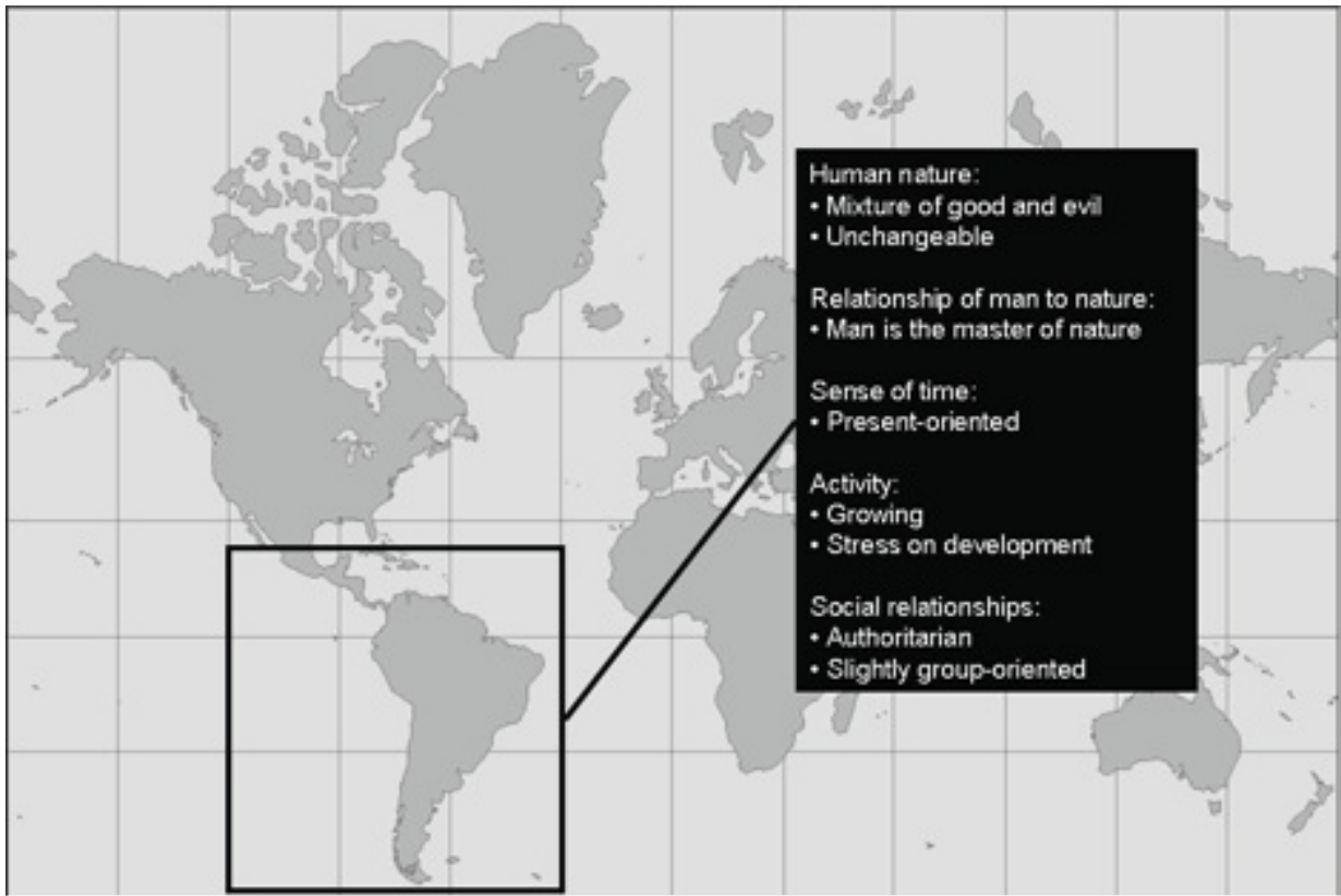
FIGURE 1, “Culture analysis — South America and Central America (to include Mexico)” Special Forces Advisor Guide, Figure 2-2 (TC-31-73) .

While these summaries are mindless in their over simplicity, it is a mindlessness of a specific sort that confirms simple institutional misunderstandings about culture by reinforcing stereotypes over vast regions of diversity. In this sense, the Guide is a relic of the military’s institutional-cognitive view of the world that instructs us of the contours of its institutional imagination. The Guide codifies and affirms prevailing social facts of the values already institutionally believed to be governing actors around the globe. These stereotypes in the Guide are selected not because they educate; but because they tell the military what it already institutionally knows, and it allows it to frame the “others” of the world as imprisoned by the exotic belief systems summarized in the Guide .