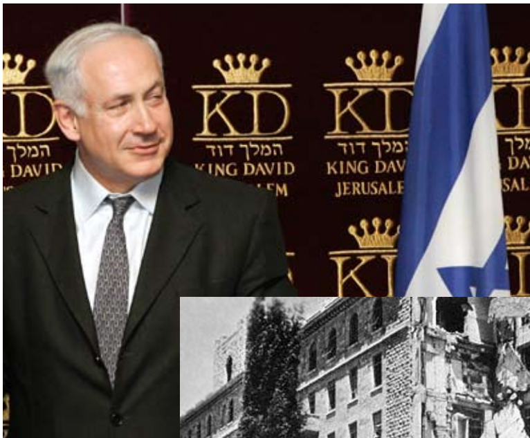
Benjamin Netanyahu, part of the Likud party grouping known as Jabotinsky's Princes, is running for the post of prime minister of Israel in the Feb. 10 elections. Here he is shown at the same King David Hotel in Jerusalem that Vladimir Ze'ev Jabotinsky's cohorts of the Irgun had bombed in 1946 (right).

The Jewish armed response was led by Jabotinsky, and a British-trained Zionist military force that had