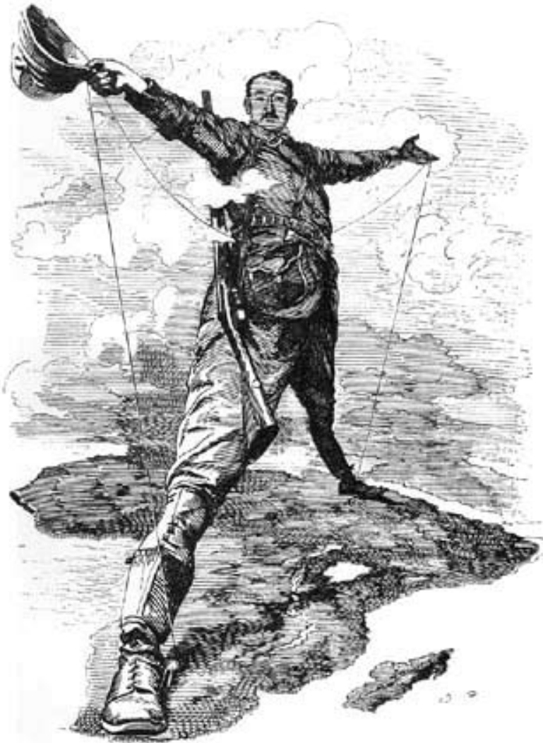
Sir Cecil Rhodes wrote that the aim of his proposed secret society was “the extension of British rule throughout the world,” especially Africa, the Holy Land, and the Valley of the Euphrates. Leo Stennet Amery, one of the masterminds of Britain’s Zionist project, walked in Rhodes’ footsteps.

system of securing cheap raw materials from colonized, backward parts of the world, and shipping them back to England for industrial production and military use.