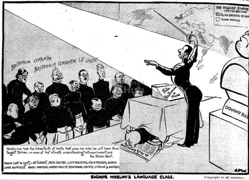
"Signor Moslini's Language Class": David Low's cartoon from The Evening Standard , June 29, 1934, mocks the enthusiasm of the British elites for a Fascist Empire. At the podium is Sir Oswald Mosley.

in was his outlook on the European problem generally. On this he talked what seemed to me vigorous commonsense. . . .