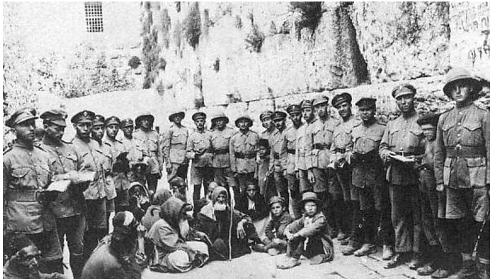
The Jewish Legion in Jerusalem after the British takeover of the city in December 1917. The Legion's creation was a British project, opposed by most Jews. After the war, it became a deadly weapon used for confrontation with the Arabs of Palestine.

On July 8, 1920, civil rule in Palestine was transferred by the military to Herbert Samuel, the new High Commissioner. One of his first acts was to provide amnesty to all those imprisoned for the Jerusalem riots, both Arab and Jew. Upon his release, Jabotinsky travelled back to Jerusalem, where he was received by his supporters, headed by Rabbi Kook. According to Jabotinsky biographer Joseph Schechtman, "He was returning to liberty as a universally recognized and acclaimed national hero: his popularity was at its peak."