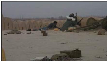
U.S. SOF and NA on the northwest parapet of the Qala-i Jangi Fortress.