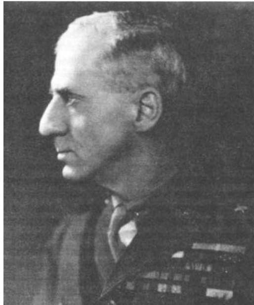
Maj. General Smedley Darlington Butler, Jr.

In the previous installment , we learned that FDR and his closest advisors had many deep and longstanding business and social ties to the DuPont family and JP Morgan, Jr., two of the key figures allegedly behind the so-called “business plot” to usurp FDR’s presidential powers. The most telling of these is the marriage between FDR’s son and a DuPont heiress just a couple of years after the business plot was revealed by the alleged bravery and patriotism of Smedley Butler. We also learned that FDR had worked on Wall Street for many years and that the major provisions of the New Deal were essentially dictated by his cronies, who were all top industrialists and financiers. So there was really no reason for them to oppose FDR’s presidency; instead their opposition was manufactured to boost FDR’s public image as the savior of the American people. In other words, the business plot was a PR move. A publicity stunt. 1 Finally, we