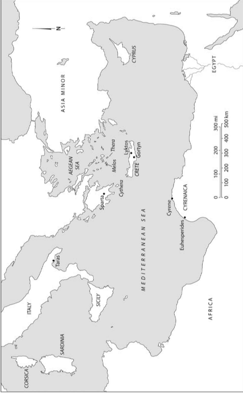
Map 3. Sparta in the Mediterranean