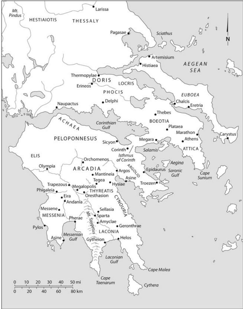
Map 1. Mainland Greece