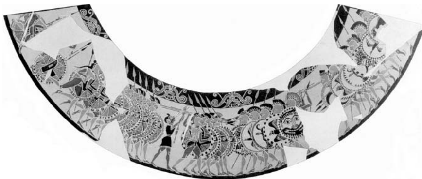
Figure 1. Clash of phalanxes represented on the Protocorinthian olpe known as the Chigi Vase, ca. 640 (at Museo Nazionale Etrusco di Villa Giulia 22679; from Ernest Pfuhl, Malerei und Zeichnung der Griechen [Munich: Bruckmann, 1923], pl. 59).