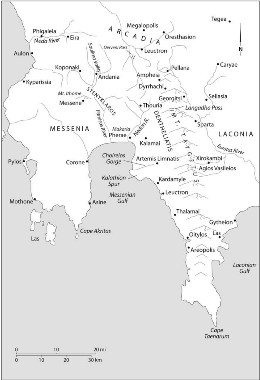
Map 4. Mount Taygetus and Messenia