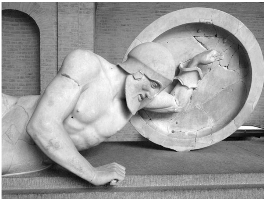
Figure 2. Fallen hoplite with hollow shield and pórpax (Trojan warrior), probably Laomedon, situated on the east pediment of the Aphaia temple at Aegina, ca. 505–500 (now in the Staatliche Antikensammlungen und Glyptothek in Munich;).

right foot forward while actually hurling the javelin or driving the thrusting spear home, he would have turned willy-nilly to face the enemy; and, when he was in this posture, the aspís left the right half of his body unprotected and exposed, and it extended beyond him to the left in a fashion of no use to him as a solo performer. Even if the hoplite ordinarily stood, as one scholar has recently suggested, in an oblique position, braced with his legs wide apart and his left foot a bit in advance of his right so that he could rest his shield on his left soldier, his right side will have been in some measure exposed. As this analysis should suggest, when infantrymen equipped in this fashion were operating on their own, cavalry, light-armed troops, and enemy hoplites in formation could easily make mincemeat of them; and the same was apt to happen when agile light-armed troops equipped with javelins caught hoplites in a situation unsuited to seeking a decision by way of phalanx warfare. The hoplite