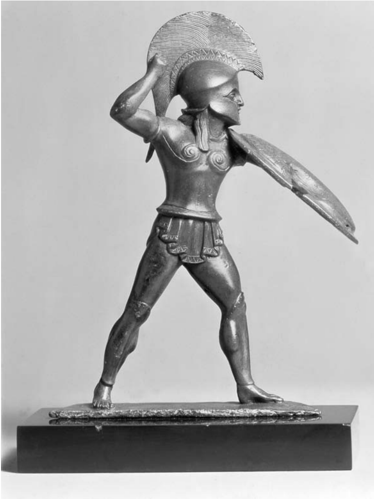
Figure 3. Hoplite poised for assault, figurine, formerly part of a bronze vessel, ca. 510–500, found at Dodona (Photograph: bkp Berlin/ Staatliche Museen zu Berlin—Preußischer Kulturbesitz/Johannes Laurentius/Art Resource, NY).

was, as Euripides contended, “a slave to the military equipment that he bore [ doûlos . . . tōn hóplōn ].” 51